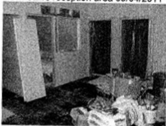
Downstairs reception area 05/04/2011

We are so grateful to God that he has moved people to give so generously that the cost has been covered by an offering of £39,043.