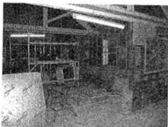
Main room upstairs 05/04/2011